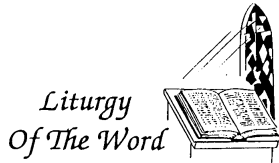
Liturgy Of The Word

God mounts his throne to shouts of joy, a blare of trumpets for the Lord.